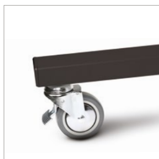
50mm (2") braked castors supplied