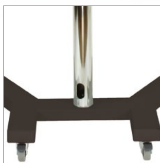
Features 1.1m chrome pole with integrated cable management holes