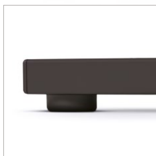
Alternative levelling feet also included