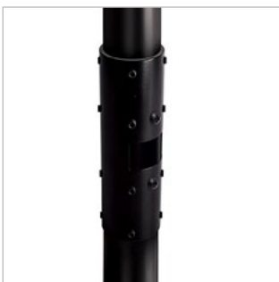
Grub screws which allow micro-adjustment of pole angle