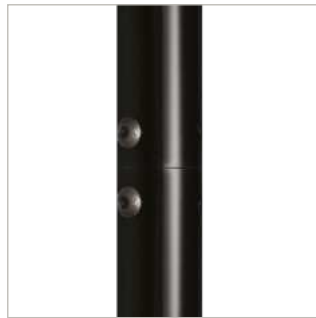
Creates a seamless pole join