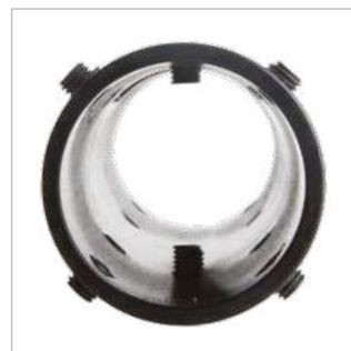
Supplied with optional short safety bolts to allow cables to pass through