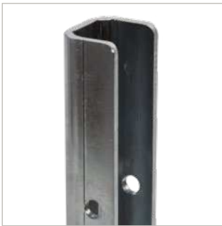
One-piece design for a quick install