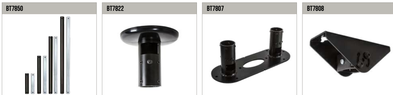
BT7850 Ø50mm Poles up to 3m in length