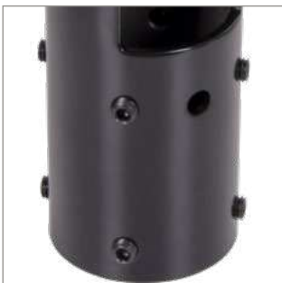
Grub screws allow micro-adjustment of the pole angle once mounted