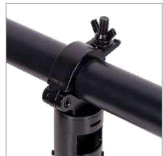
Fits truss systems from 42mm up to 50mm