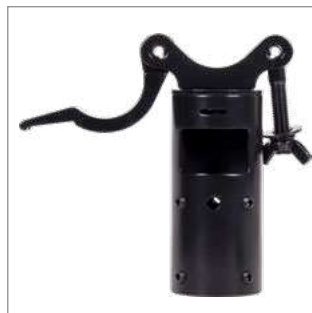
Wing-nut fixing allows quick release of the clamp from the pole