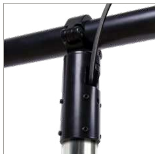
Integrated cable management for a neat and tidy installation