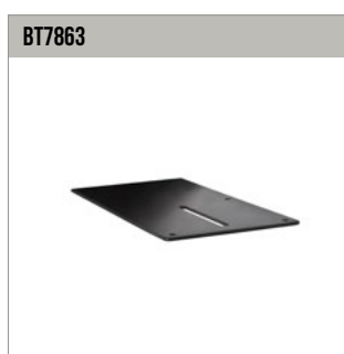
VC Camera Shelf compatible with BT7052, BT7841 and BT7260 Accessory Collars