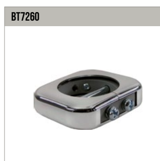
ø60mm Accessory Collar single attachment