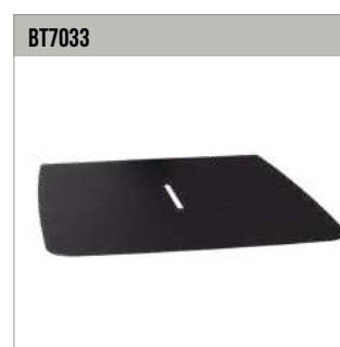
Small Accessory Shelf ideal for use with B-Tech poles