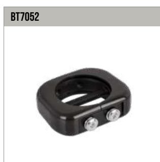
ø50mm Accessory Collar single attachment