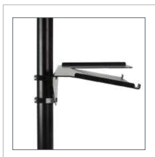
10° tilt on keyboard shelf for ease of use