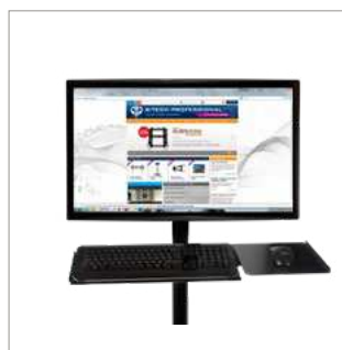
Sleek design integrates with B-Tech mounting systems for a stylish installation