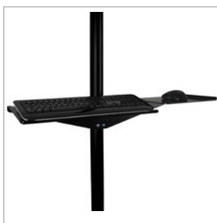
Mounts to a single pole using 1 x Ø50mm or Ø60mm accessory collar (sold separately)