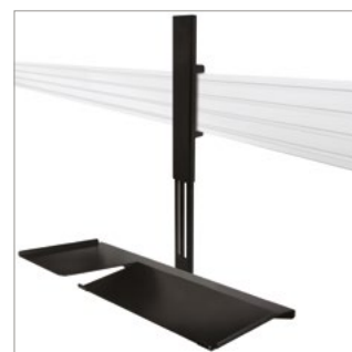
Also compatible with the System X range