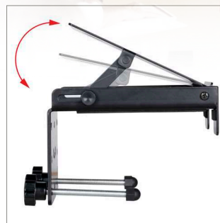
Shelf can be positioned flat or with a downward tilt up to +25°