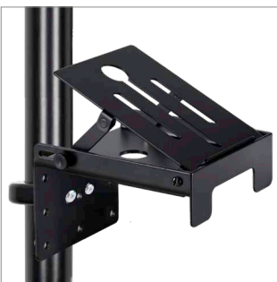
Can be fitted to poles using B-Tech Accessory Collars