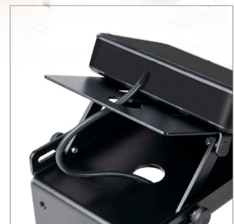
Integrated cable management