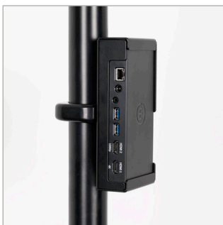
Can be fitted to poles using B-Tech Accessory Collars.