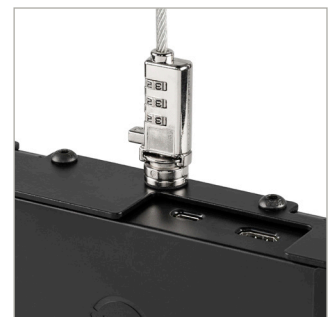
Compatible with Kensington Slot Locks.