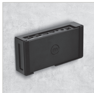
Can also be mounted directly to a wall.