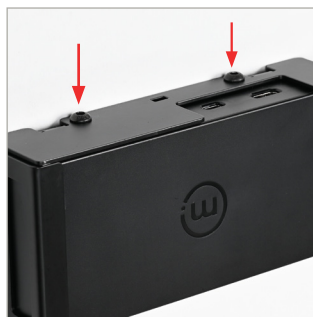
Security screws to prevent easy removal of Pod device.