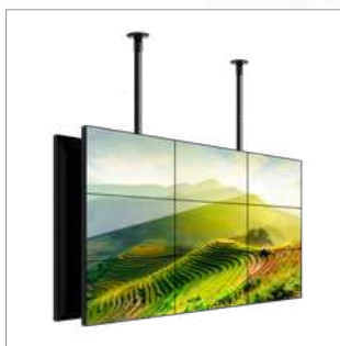
Heavy duty steel plate capable of supporting heavy loads