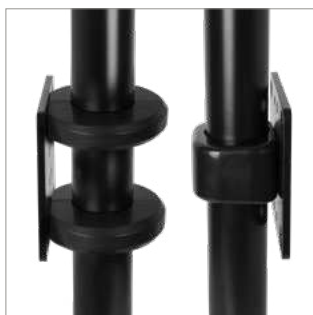
For use with 2x BT7841 2-Piece Collars or 1x BT7051