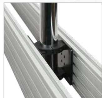
Suitable for back-to-back configurations (multiple brackets required)