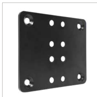
Countersunk fixing holes keep the install looking neat and tidy