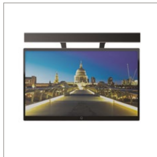
Mounts soundbar above or below the screen