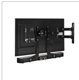
Ideal for corner installations with an articulated mount