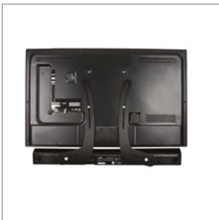
Fits easily to the back of the screen