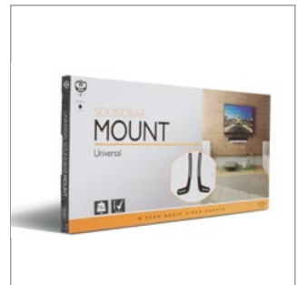
Supplied in retail packaging, ideal for the consumer market