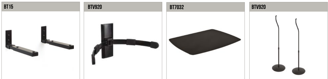
BT15 Centre Speaker Wall Mount with Adjustable Arms for speakers up to 15kg