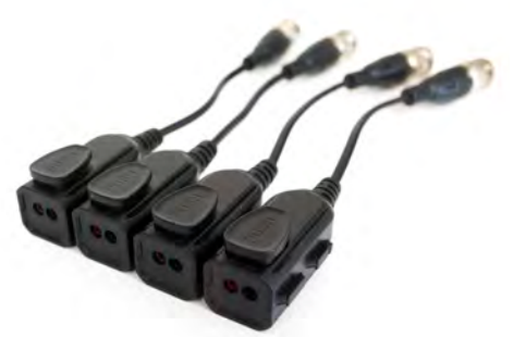
Easy Push Button for Cable Entry

Join together for tidyness behind DVR, no need for expensive hubs