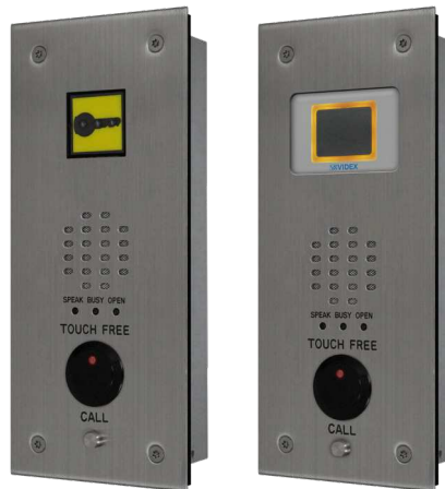
VR120 AUDIO NT SERIES + PROXIMITY