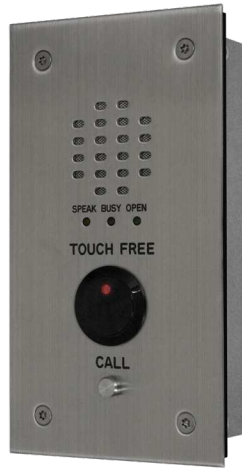
VR120 AUDIO NT SERIES