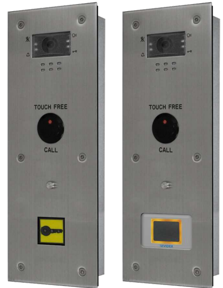
VR130 VIDEO NT SERIES + PROXIMITY