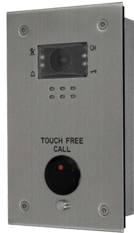
VR130 VIDEO NT SERIES