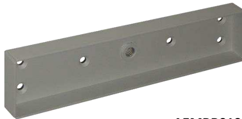
AEMBR019 Flush/Mortice Armature Housing