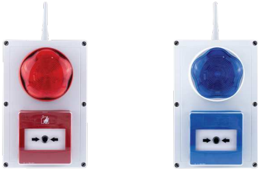
NXICSB / NXESB - Red/Blue

Internal/External call-point with sounder/beacon in red/blue