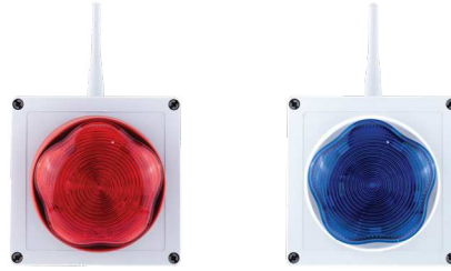
NXISB / NXESB - Red/Blue

Internal/External call-point with sounder/beacon in red/blue