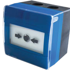
NXICP - Red/Blue