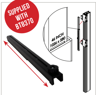
Screen spacer designed to eliminate calculations and guess work when installing horizontal rails