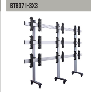
BT8371-3X3 Universal Mobile Videowall Stand for 3x3 Videowalls