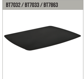
BT7032 / BT7033 / BT7863 AV Accessory Shelves can be attached directly to a vertical column