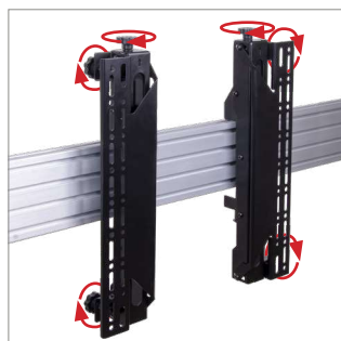
Tool-less micro-adjustment for seamless display alignment