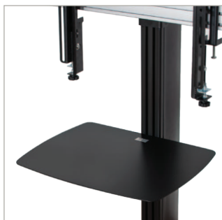
Fit System 2 compatible accessories such as shelves without using collars