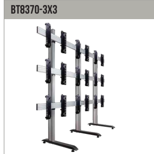
BT8370-3X3 Universal Freestanding Videowall Stand for 3x3 Videowalls screens up 55"