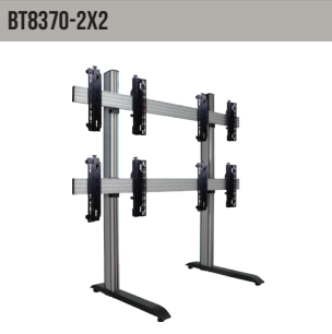
BT8370-2X2 Universal Freestanding Videowall Stand for 2x2 Videowalls