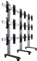
Mobile Universal Videowall Stand For 3x3 Videowalls screens up to 55"