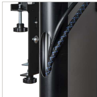
Cable management covers hides untidy cables and adds to the stylish finish