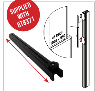
Screen spacer designed to eliminate calculations and guess work when installing horizontal rails