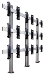
Universal Bolt Down Videowall Stand For 3x3 Videowalls