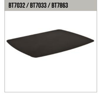
AV Accessory Shelves can be attached directly to a vertical column