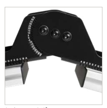
Angle up to +/-45° to create a concave or convex curved videowall