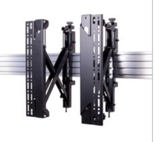
BT8390-VESA400MAP pop-out arms for full service access