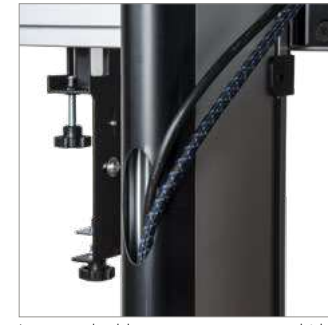
Integrated cable management covers hide untidy cables and add to the stylish finish