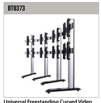
Universal Freestanding Curved Video Wall Stand shown as a 2x4 Video Wall