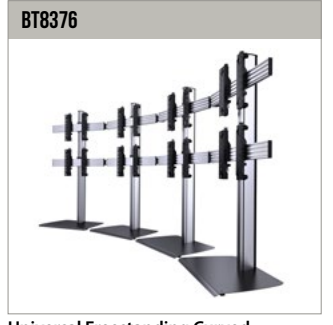
Universal Freestanding Curved Videowall Mount shown in 2x4 configuration