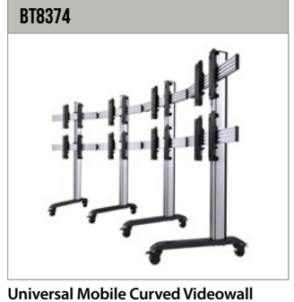
Universal Mobile Curved Videowall Stand shown as a 2x4 Video Wall