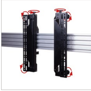
Tool-less micro-adjustment for seamless