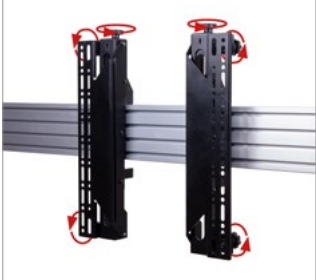
Tool-less micro-adjustment for seamless screen alignment