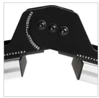
Angle up to +/-45° to create a concave or convex curved videowall