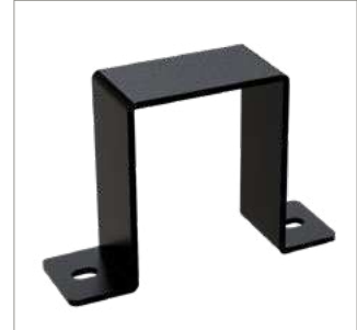
Bracket bolts down into floors to provide extra stability and added security (fixings are not provided)