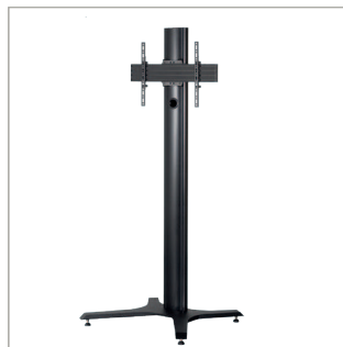
One BT8385-RTC is required to fit a mounting rail across a single column install.