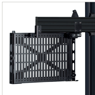
Use BT8385-RTC alongside BT8390 Mounting Rail to fit a BT7884 Flip Down Storage Tray to a Mode-AL Vertical Column.