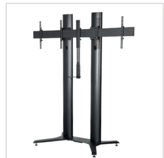
Two BT8385-RTC are required to fit a mounting rail across a twin column install.