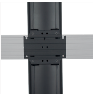
Designed to connect a BT8390 mounting rail to Mode-AL Vertical Columns.