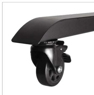
Includes non-marking 4" locking/braked castors