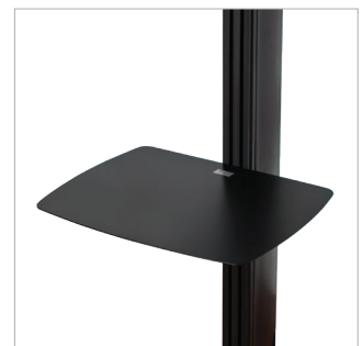
Collar compatible accessories such as shelves can be fitted directly to the columns