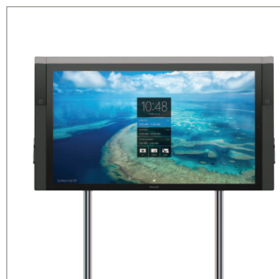
Interface arms include levelling screws to adjust the height of the screen