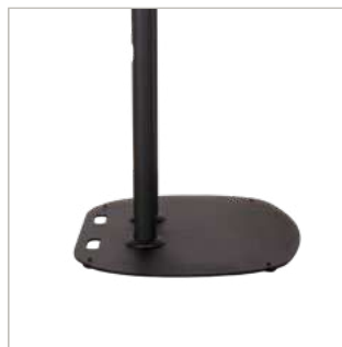
Can be displayed freestanding or bolted to the floor