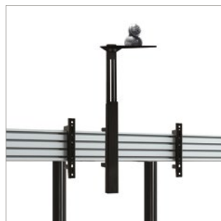
Includes VC shelf which can mount camera above or below the screens