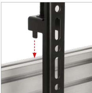
Simple 'hook-on' installation