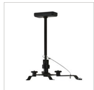
Extra rod supplied for increased ceiling drop