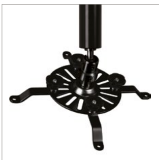
Unique 'carousel' mounting plate for universal compatibility