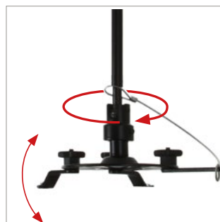
Ball joint adjustment for easy positioning of projector