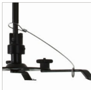
Steel safety wire for extra security