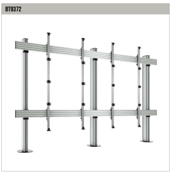
BOLT DOWN UNIVERSAL DIRECT VIEW LED VIDEOWALL STAND