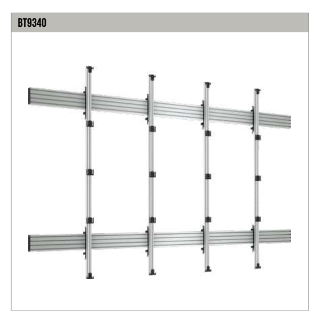
UNIVERSAL DIRECT VIEW LED VIDEOWALL MOUNT