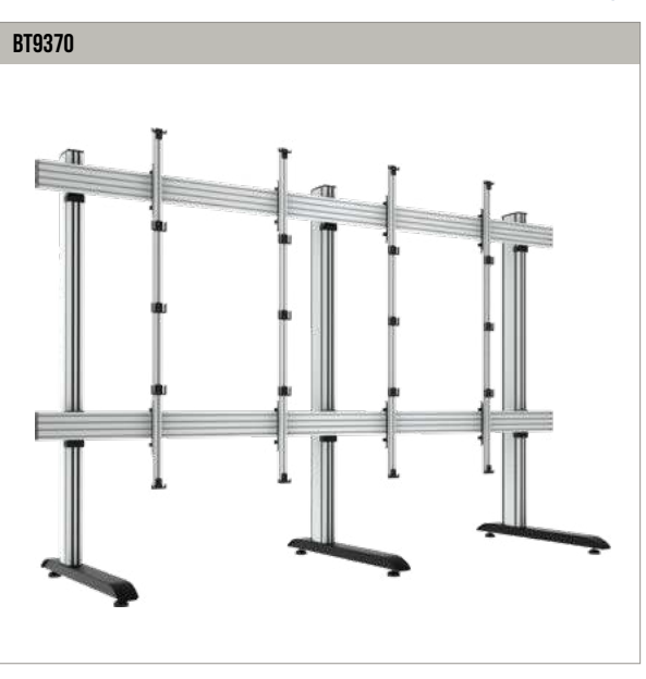
FREESTANDING UNIVERSAL DIRECT VIEW LED VIDEOWALL STAND