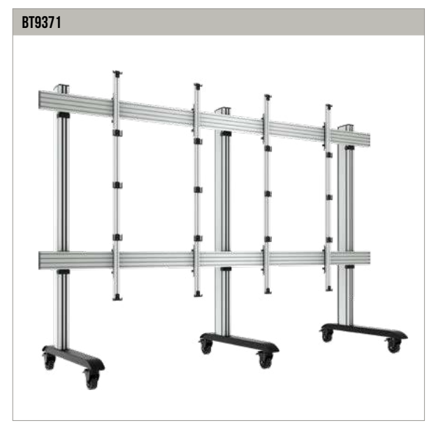
MOBILE UNIVERSAL DIRECT VIEW LED VIDEOWALL STAND