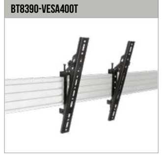
VESA 400 Interface Arms designed to mount medium / large sized screens in a tilted position