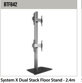
designed to mount two screens, one above the other, in portrait or landscape style