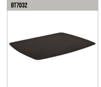
Large AV Accessory Shelf is ideal for adding AV accessories such as a Blu-Ray player or laptop to an installation or a wall