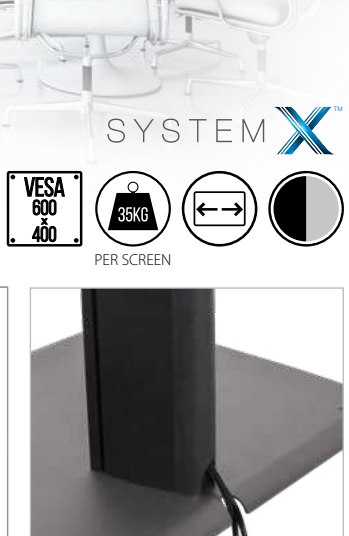
Integrated cable management for a neat and tidy installation