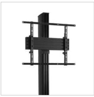
Maximum VESA fixing can be increased to 600mm using the included adapter arms