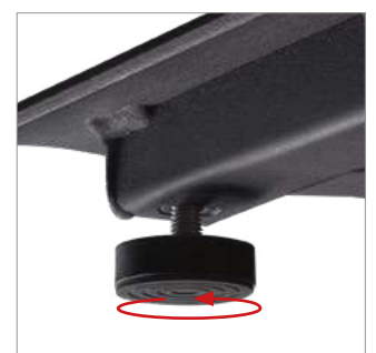
Supplied with adjustable levelling feet to accommodate uneven floor surfaces