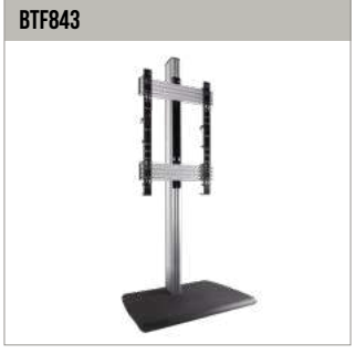
System X Portrait Floor Stand - 1.8m designed to mount a single large screen in portrait style