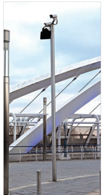
AW1592/6 in stainless steel