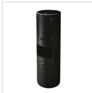
Poles can be linked together using BT7823 & BT7824 Pole Joiners