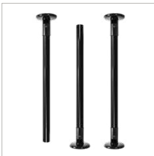
Can be mounted from floors, ceilings or both for more mounting flexibility