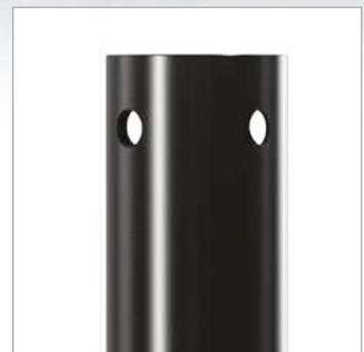
Features safety bolt holes at the top and bottom for secure installation