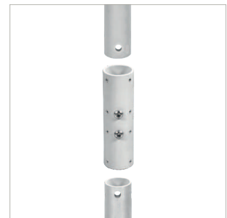
Poles can be joined together using BT5924 Pole Joiner for extended drops