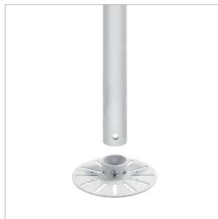
Attaches directly to BT5910 / BT5911 Security Camera Mounts