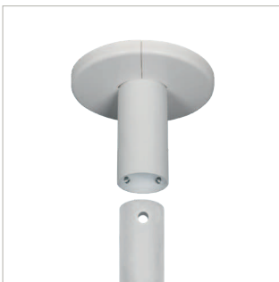
Fits to BT5920 Ceiling Mount