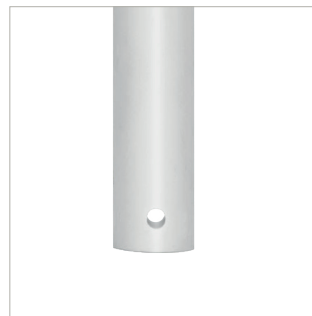
Safety bolt hole ensures a secure installation to System V components