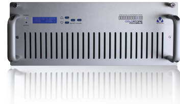
COLDSTORE Colossus Front Panel includes LCD system info and disk status LEDs

COLDSTORE Colossus is ideal for projects requiring affordable high storage capacity, extended disk lifetimes, very long file-retention times and simple system management.